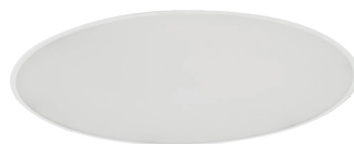
PLAFO 900 RE LED trimless version - mounted in the ceiling