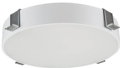
PLAFO 900 RE LED trimless version. Index no. 6578