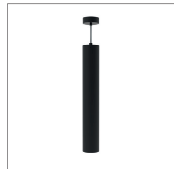
TUBE 80 L PND