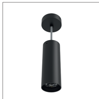
TUBE 80 PND