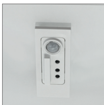
IC daylight&occ sensor

All current index numbers, lumen outputs, power consumption and many other technical information are available in our 2024 pricelist. Details on wireless lighting control systems on page number 896.