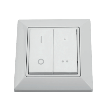
ICSW wireless switch