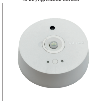
ICS wireless daylight&occ sensor