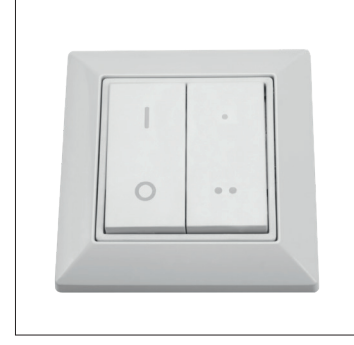
XCS wireless switch