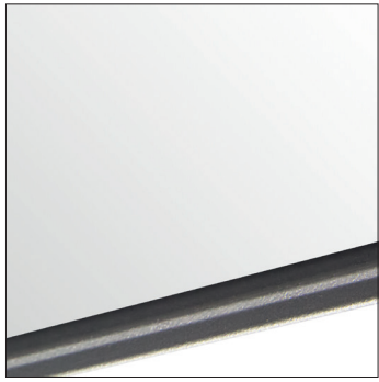
OP opal diffusor