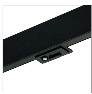
XC daylight&occ sensor

All current index numbers, lumen outputs, power consumption and many other technical information are available in our 2024 pricelist. Details on wireless lighting control systems on page number 896.