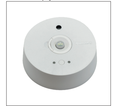
MCS wireless daylight&occ sensor